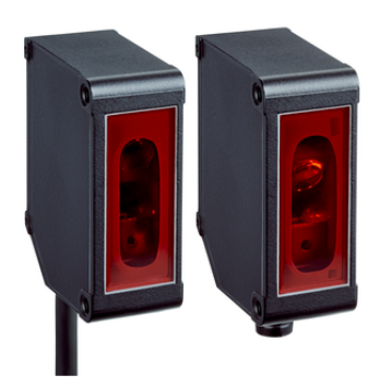
OD Mini in aluminum housing – for highly dynamic applications, e. g. robotic arms and grippers