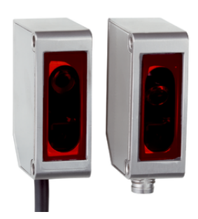
OD Mini in stainless-steel housing – the rugged version for use in harsh environments

OD Minis are among the world's smallest displacement measurement sensors with display and control elements in terms of their dimensions (44.4 mm x 31 mm x 17 mm). The product family impresses with its measurement accuracy in the µm range as well as the high-quality fittings, compact size and low weight. The OD Mini is available in two housing designs.