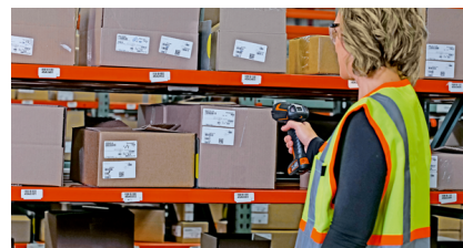
Scanning processes in intralogistics: high productivity thanks to reliable read results even for several thousand scanning operations per day