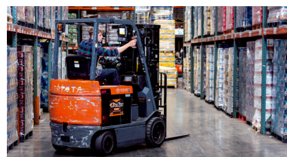
Use in high-bay warehouses and marshaling yards: effective reading of bar codes on pallets or stacked containers