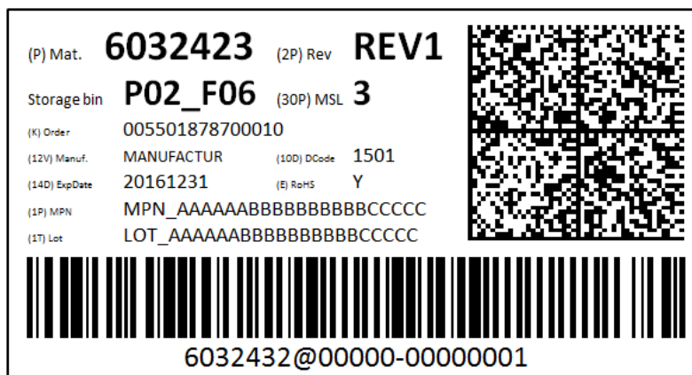
Figure 4: Example Label